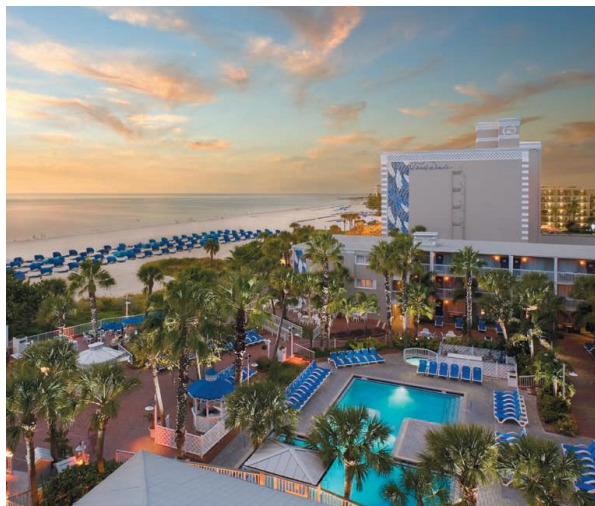
Tradewinds Island Grand Resort