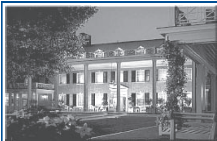
Carolina Inn ... venue of the 44th Annual Meeting