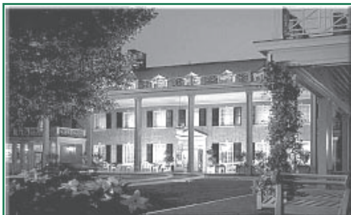
Carolina Inn ... venue of the 44th Annual Meeting

Monday, July 14, 2003 .... The morning (8 am - 12:45 pm) will be devoted to another exciting symposium on the NCDDGs program . In the afternoon there are oral presentations and poster session. The day will end with a fabulous traditional NC Bar-B-Q reception at the famous Fearington Barn. ( Details, p.7 )