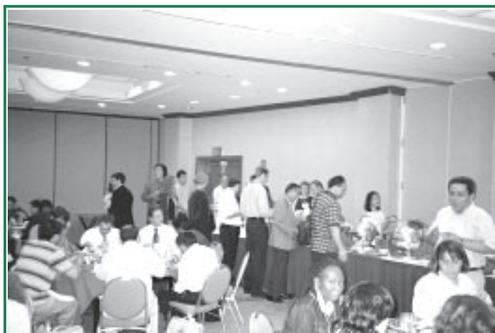
ASP 2002-YMC Mixer at New Brunswick, NJ...

www.phcog.org/AnnualMtg/Generalprogram.html