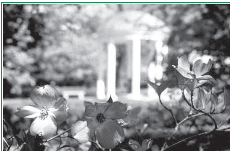
Old Well... One of the most photographed spots on the campus of UNC.