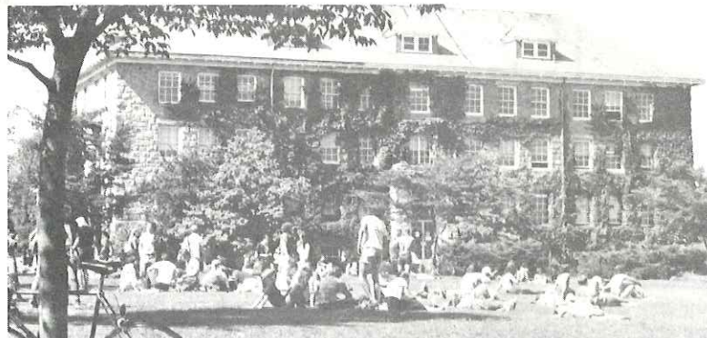
University of Rhode Island Campus at Kingston