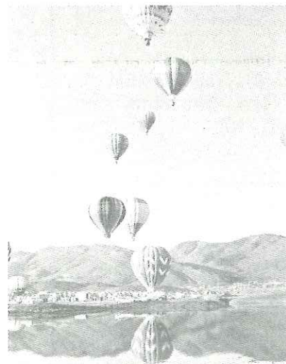
Hot Air Balloons are a Common occurrence in Park City, Utah