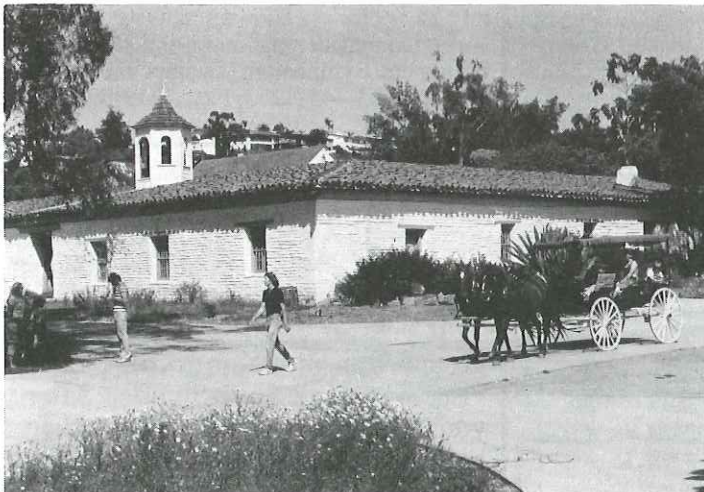
"Old Town State Historic Park" San Diego Convention & Visitors Bureau

The topics for this year's symposia include: Biodiversity, Targeted Drug Discovery, NCI Intramural Drug Discovery, and National Cooperative Drug Discovery. See page two for a listing of the symposia participants and their presentation titles.