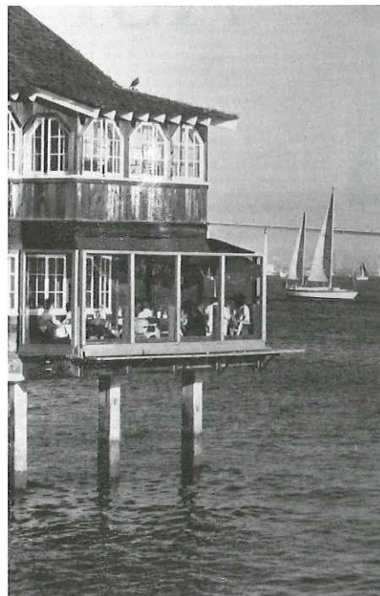
"Seaport Village Dining" San Diego Convention & Visitors Bureau

sorship of both the morning NCI Intramural Drug Discovery Symposium and the afternoon National Cooperative Drug Discovery Symposium on Thursday. The Third Drug Discovery and Development Symposium will continue through Saturday, July 24, 1993.