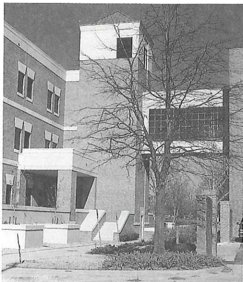
NATURAL PRODUCTS CENTER UNIVERSITY OF MISSISSIPPI

In addition, W e d n e s d a y evening offers optional tours to the casinos or the Memphis Cook Convention Center and Beale Street.