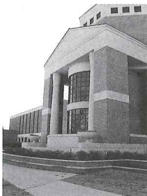
NATURAL PRODUCTS CENTER UNIV. OF MISSISSIPPI

All-in-all, the annual meeting at Ole' Miss should be quite successful. We look forward to seeing you there.