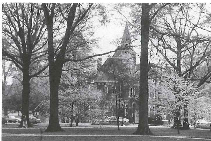
UNIVERSITY OF MISSISSIPPI--THE CIRCLE AND VENTRESS