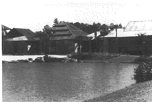
Cabanas at Coronado Springs