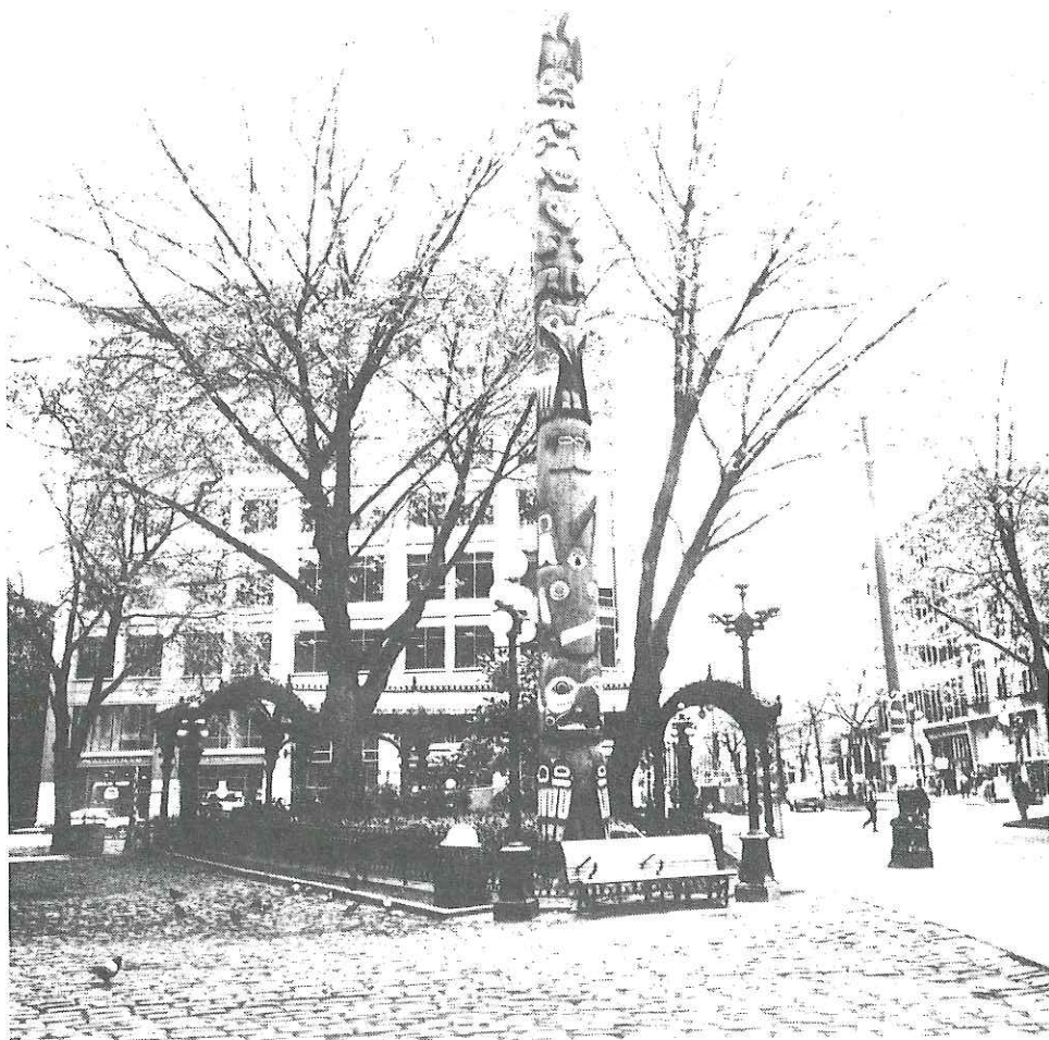
Seattle's original city center is Pioneer Square, currently a historic district housing galleries, restaurants and retail shops.

but finding affordable housing in Seattle in July is not easy. Even traditionally less expensive hotel chains will have room rates that are considerably higher than you might expect. Hotel rates may be cheaper further from Seattle, but car rentals and parking will negate any cost savings due to room rates. Also, Seattle traffic is not pretty. Therefore, we encourage members to consider staying