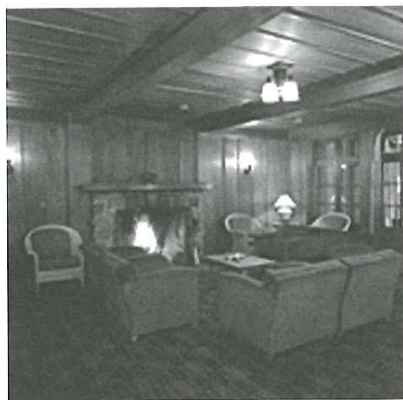
Asilomar Conference Center

Mark your calendars now and plan to attend what will be an interesting, informative meeting in a pleasant and attractive setting. Sponsorship opportunities will be offered for the poster session, meals and reception.