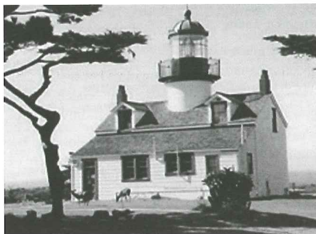
Point Piños Lighthouse

Full details will be provided as a circular, but will also be posted on the organization web-sites. A pdf version of this announcement is available from the following sites.