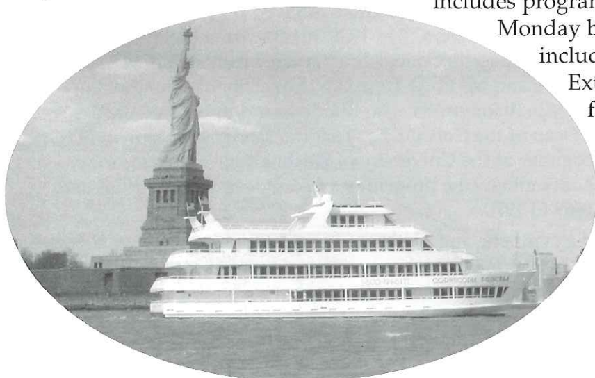
The Cornucopia Princess passing the Statue of Liberty.

Visit the Society's website at http://www.phcog.org/