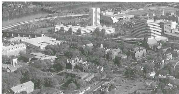
New Brunswick, NJ – The Health Care City and Home of Rutgers, The State University of New Jersey and The Waksman Institute of Microbiology.

Over 250 ASP members and non-members have already registered for the meeting. Join them by registering now and avoid the last minute rush. Special events tickets are limited and we would not want you to miss