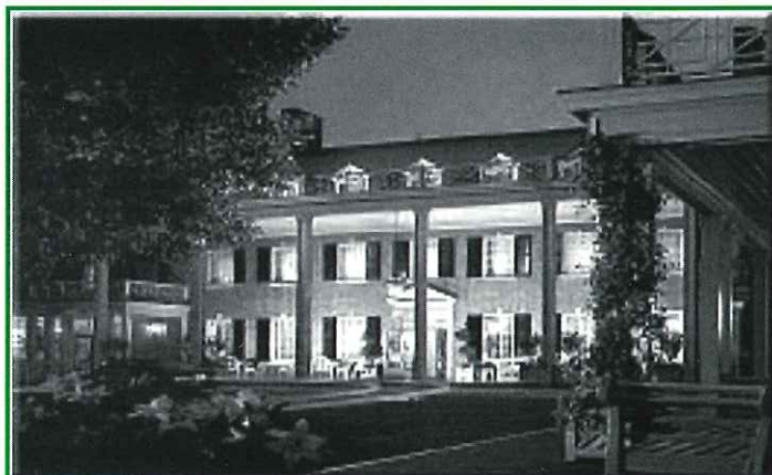
Carolina Inn ... venue of the 44th Annual Meeting

Monday, July 14, 2003 .... The morning (8 am - 12:45 pm) will be devoted to another exciting symposium on the NCDDGs program . In the afternoon there are oral presentations and poster session. The day will end with a fabulous traditional NC Bar-B-Q reception at the famous Fearington Barn. ( Details, p.7 )