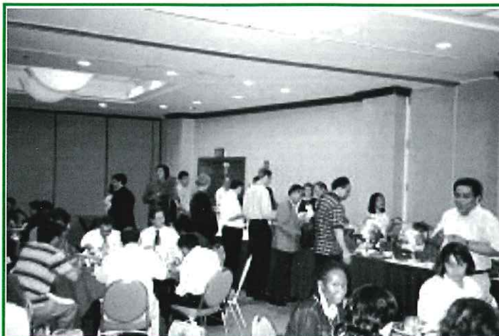
ASP 2002-YMC Mixer at New Brunswick, NJ...

www.phcog.org/AnnualMtg/Generalprogram.html