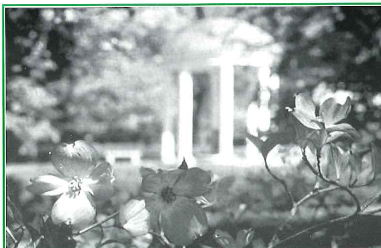
Old Well... One of the most photographed spots on the campus of UNC.